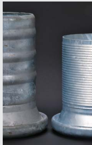
Bauer-style vs. Campbell Ball & Socket