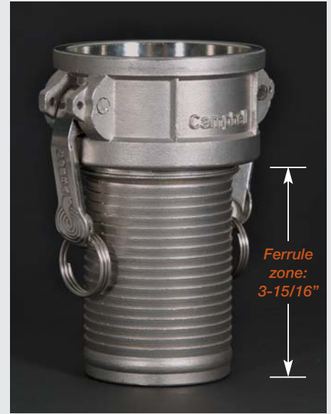
Campbell Cobra Part C and matching Campbell Interlocking Ferrule