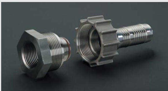
(left) 1" ChemJoint Coupling Set