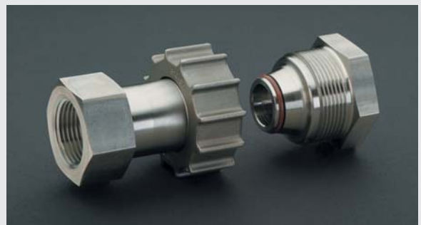
(right) 1" ChemJoint Union with Viton Spud