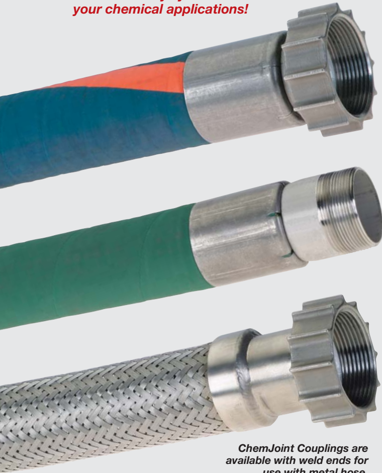
ChemJoint Couplings are available with weld ends for use with metal hose.

CampbellCrimpnology™ offers hose assembly systems for all your chemical applications!